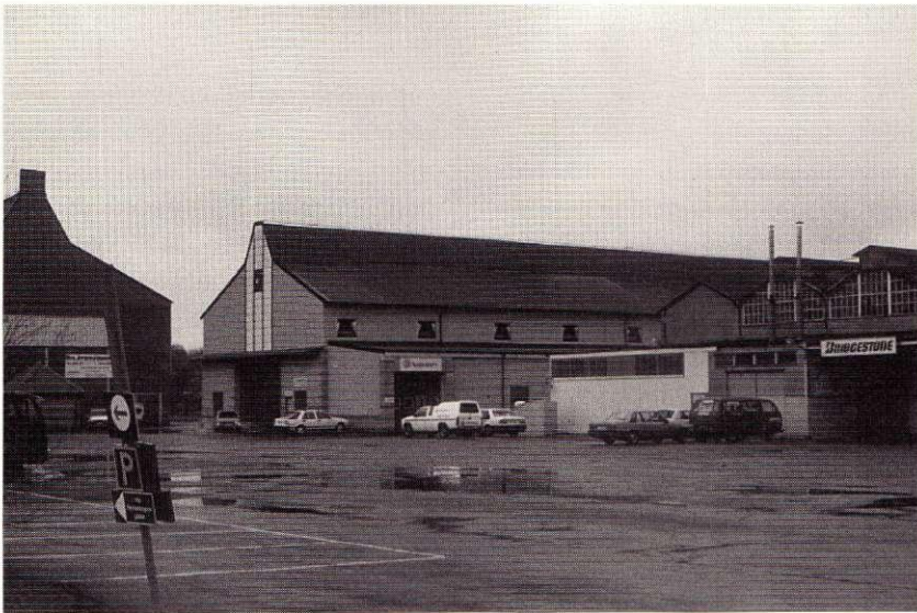
A small developer has renewed an old industrial estate, Grafiten, providing new office space at the entrance of the estate, as well as low cost, refurbished industrial space in less prominent locations.

While the identity of an area is usually bound to long-lasting factors which are difficult to change, attractiveness is a quality which is apt to change quicker. Certain firms which moved away from Nohab criticised the way the area was managed, as well as the plans for changed land-use. One of the two property owners is a large construction and property company, which for among other reasons purchased its part of the former works area for the construction of housing. According to some of the firms interviewed, these plans to construct housing, and to demolish some of the older industrial buildings, have given rise to uncertainty about the future of this area as an environment for small enterprise.