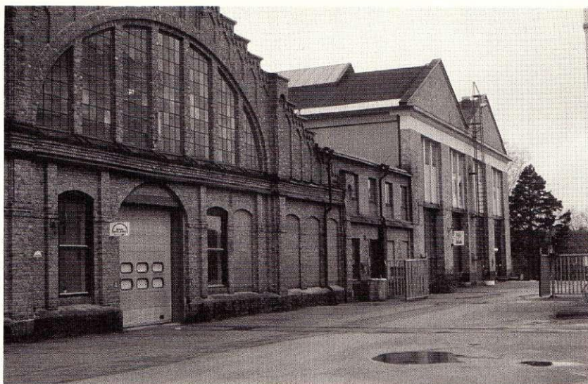
Nohab is a heavy industry complex which for some time has served as a small business incubator.

The Nohab area, however, is also an example where a clear identity is not in itself the same as being highly attractive . In the local authority's heritage conservation programme, this impressive and, from the industrial heritage point of view, important complex had an insignificant place. There were plans to demolish part of this complex in connection with the provision of new housing.