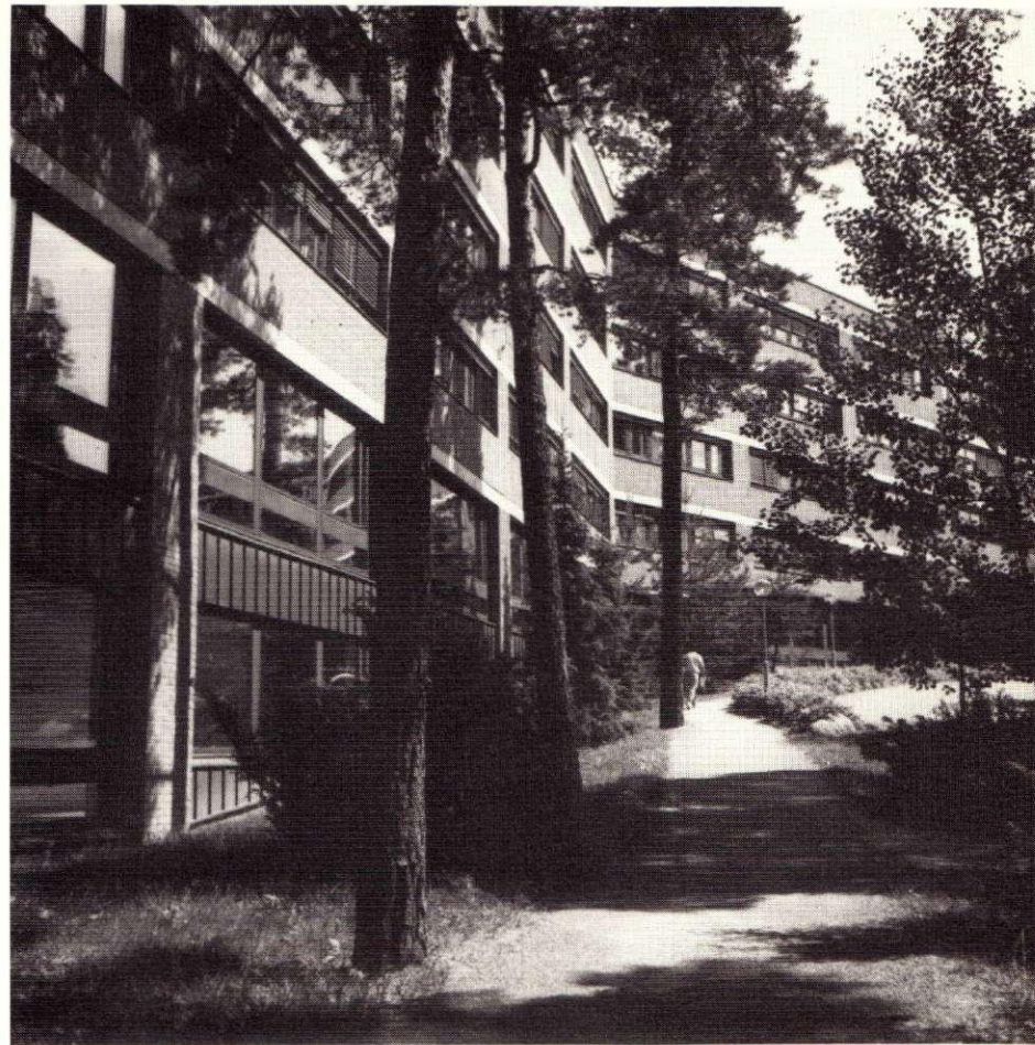
Figure 8. Thanks to a well-planned construction process and new methods of biological landscape engineering, employees at IBM's Kista offices enjoy forest right outside their windows.

In the field of road construction, however, there was basically no interest in aesthetic issues or the experience of the traveler throughout the 1970s and until the end of the '80s. That changed with the 1987 requirement that all road project proposals be accompanied by an environmental impact assessment, and the establishment in 1989 of a cultural and aesthetic advisory committee to the Department of Roads. The environmental impact assessment, however, has reduced the issue of environmental sensitivity to a matter of restrictions. These restrictions stand in opposition to economic and traffic safety requirements. The results of the policy's inherent conflict can be seen in the latest Swedish roads, which