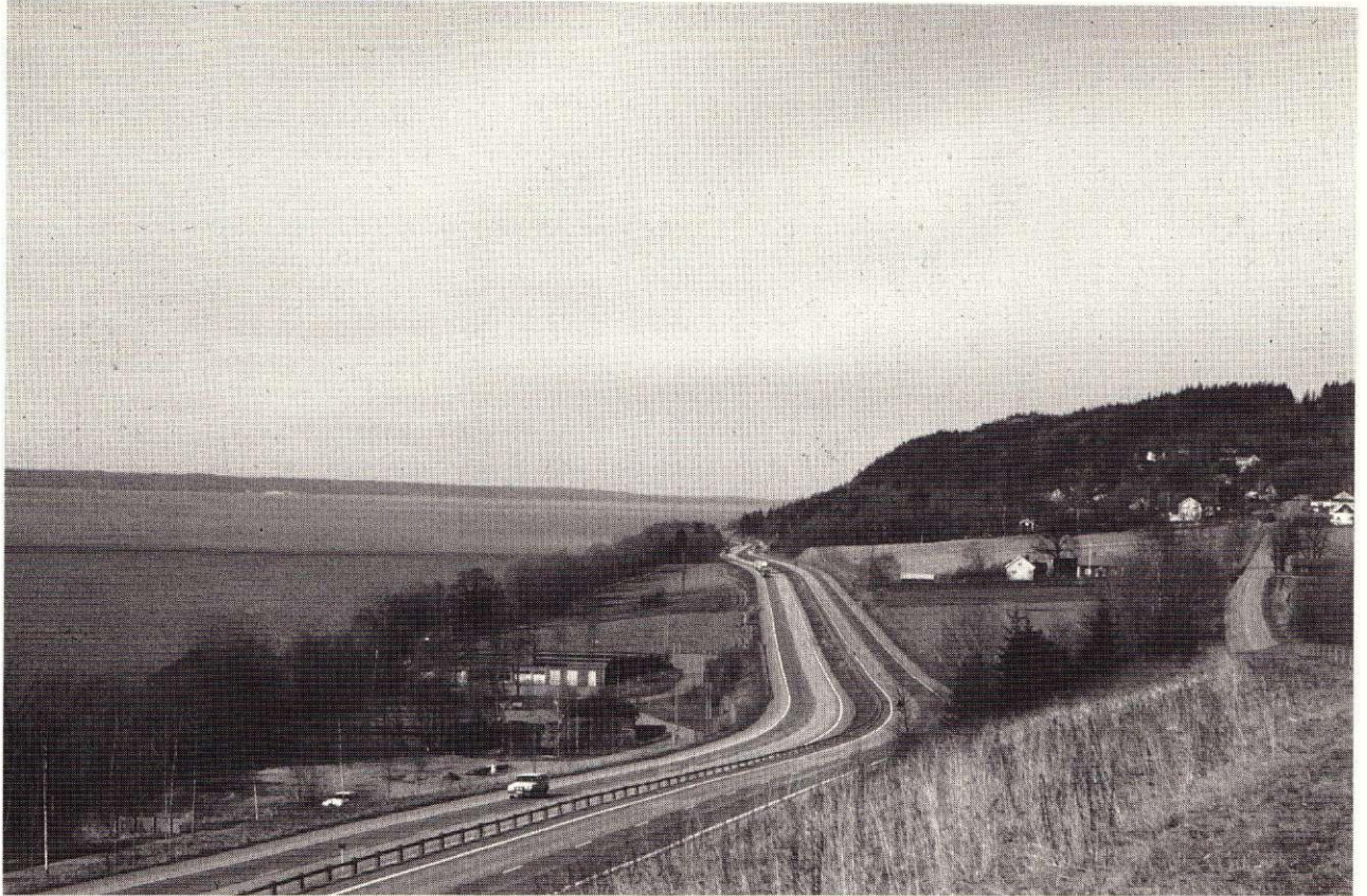
Figure 6. E4 along the eastern edge of the lake Vättern has been called "the most beautiful stretch of highway in Sweden." The curve of the road responds playfully to the line of the beach as well as the hilly terrain.

follows the beach along the eastern edge of the lake Vättern, has been called the most beautiful highway in Sweden (Fig. 6). The line of the highway is drawn in concert with the landscape, harmonizing both with the undulating terrain and with the straight edge of the beach. In addition, travelers are treated to numerous views of the island of Visingsö caught in the mirror of the lake. The segment around Huskvarna gained particular attention: of three possible alternatives, the architects