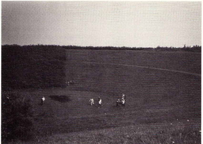
Figure 10. Sankt Hans Hills in Lund, a landfill turned into a recreation area with strongly geometric forms. Topographical variations are further accentuated by changes in the texture of the planted areas.

The quality of construction of a facility is conveyed not by the main