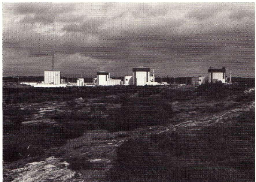
Figure 11. Ringhals Nuclear Power Plant. The brilliant bright yellow color clashes with the colors of the barren, rocky heath. The contrast is conscious and clear.