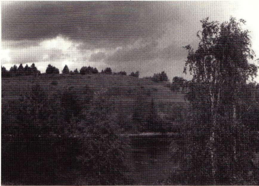
Figure 5. Professor Erik Lundberg preferred geometrically precise terrain forms and open grass surfaces. At Stornorrfor's Power Station, this aesthetic led to future problems with erosion and the encroachment of seedlings on the lawns.

entail high maintenance costs. He proposed some simple alternative measures that would help the natural vegetation reestablish itself. As predicted, Lundberg's aesthetic composition brought the project future maintenance problems. The steep, naked slopes were exposed to the powerful forces of erosion, and continual work was required to prevent seedlings from sprouting up on the open lawns (Fig. 5).