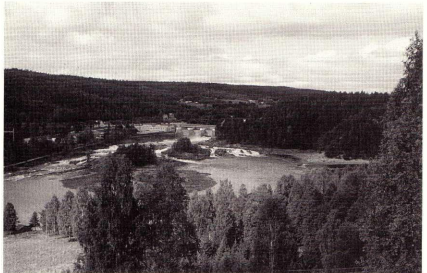
Figure 4. Nämforsen Hydroelectric Power Station in Ångermanälven is one of the most beautiful in Sweden. The softly rounded shaping of the terrain and the planting of naturally occurring vegetation connect the power plant to the local landscape.

Increasing popular interest in nature conservation during the 1940s, together with new legislation that guaranteed vacation rights to workers and thus made it possible for the general public to pursue outdoor leisure interests, led to a new environmental protection act in 1952. The new law demonstrated a clear transition toward a more socially and aesthetically motivated conservation strategy. But the political powers were reluctant to delegate the resources necessary to make the legislation effective. Conservation interests were repre-