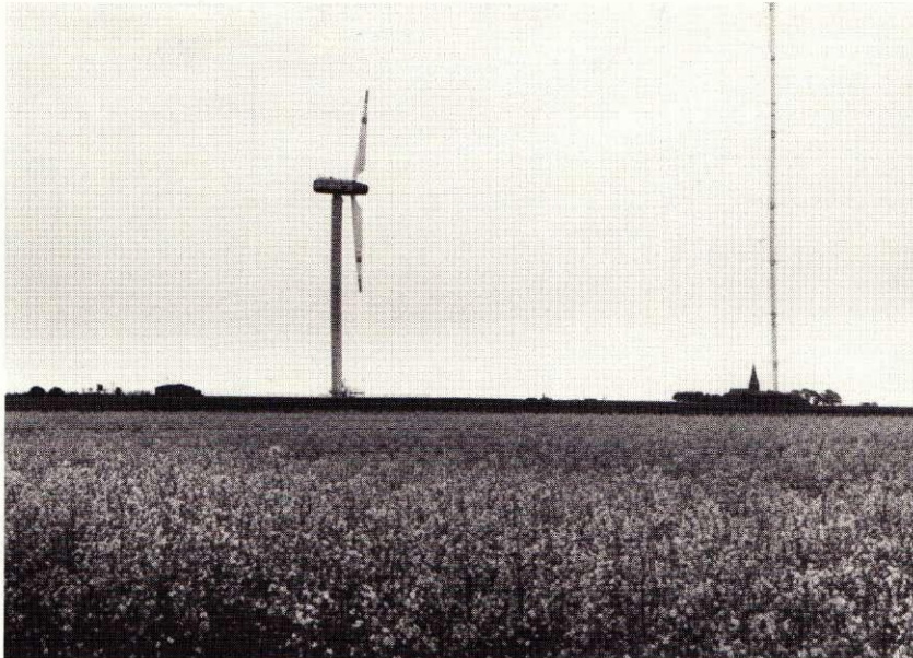
Figure 9. The windmill in Trelleborg, one of two prototypes built in Sweden, was finished in 1982. The meeting between a structure of such formal clarity and dominant size (85m) and the landscape is best if unmitigated by subsidiary elements. Fences, smaller buildings, and a meteorological mast are distracting and detrimental to the overall impression of the facility.

tion is more readily accepted if the new construction is deemed interesting or useful than if it is judged to be unnecessary or detrimental to the site. A good example is the contrast between a windmill and a nuclear reactor: most people's impression of the two depends on their view of how the problem of energy production should be resolved. For most kinds of industrial construction, the observer's opinion of the facility is profoundly affected by his or her attitude toward the business it houses. This is particularly true in cases where local residents depend upon that business for their livelihood. Security in the form of employment must often be weighed against security in the form of a clean and unspoiled environment. In the debate over hydroelectric power expansion in Norrland during the 1960s,