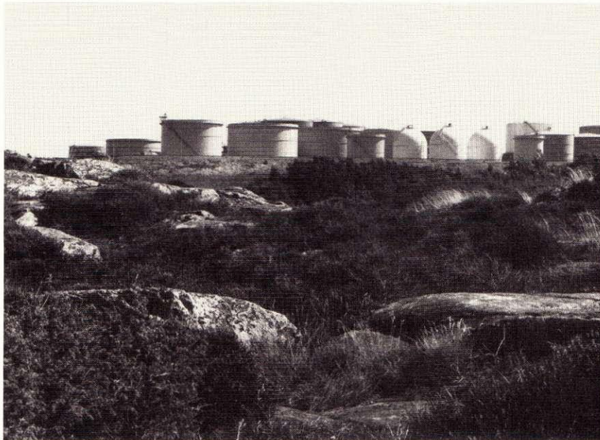
Figure 7. ScanRaff in Lysekil in the Bro Fjord. The refinery was sited on the dry, sterile, rocky plateaus, preserving the valleys, with their luxuriant vegetation, as so-called living zones.

The 1964 law and the establishment of a central governmental authority on the environment dismantled the earlier structure in which the Swedish Society for Nature Conservation and the Association of Local Historical Societies were employed as expert authorities on environmental issues. The two were now divided into separate camps, the former concentrating on preservation issues and the latter on lobbying for environmentally sensitive landscape design. As a result, design issues became less and less important in the debate on the environment. Meanwhile, the aesthetic ideal underwent a thorough change from asserting the industrial character of new structures to almost complete subordination to nature. Landscape design became equated with finding measures to hide the signs of industrial activity.