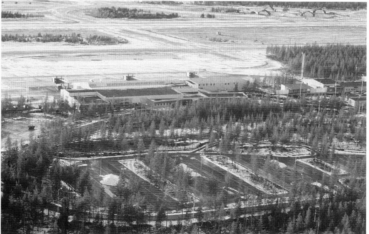
Figure 12. Kallax Airport, Luleå, in the middle of one of the country's largest pine heaths. Despite the adaptation to site conditions, the boundary between preserved nature and planted park is clear.

Routing power lines perpendicular to topographical curves may expose those lines, but it also adds life to the landscape by accentuating its topographic variation. Constructed patterns can strengthen the natural forms of the terrain, as when the height of a hill is emphasized by lines that rise with the ground to the summit, while lines that wrap around the a hill diminish the impression of height, flattening out the landscape.