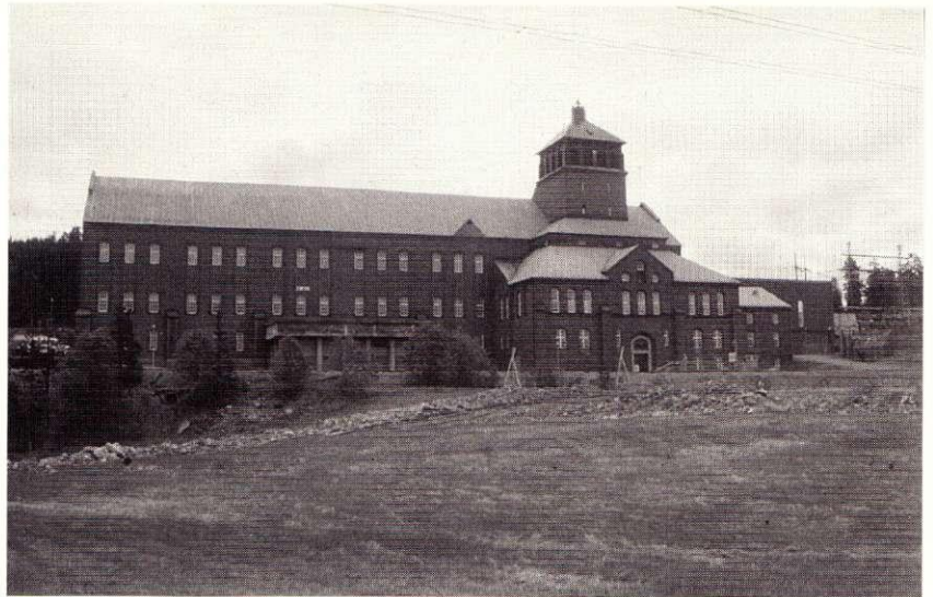
Figure 2. The signal box building in Porjus designed by Erik Josephsson. Built in monumental style, it gained a great deal of attention when it opened in 1915. The papers called it "the temple in the wilderness."

In 1939, the government created the post of highway advisor to monitor the road expansion, and the same year Sven Hermelin, a landscape archi-