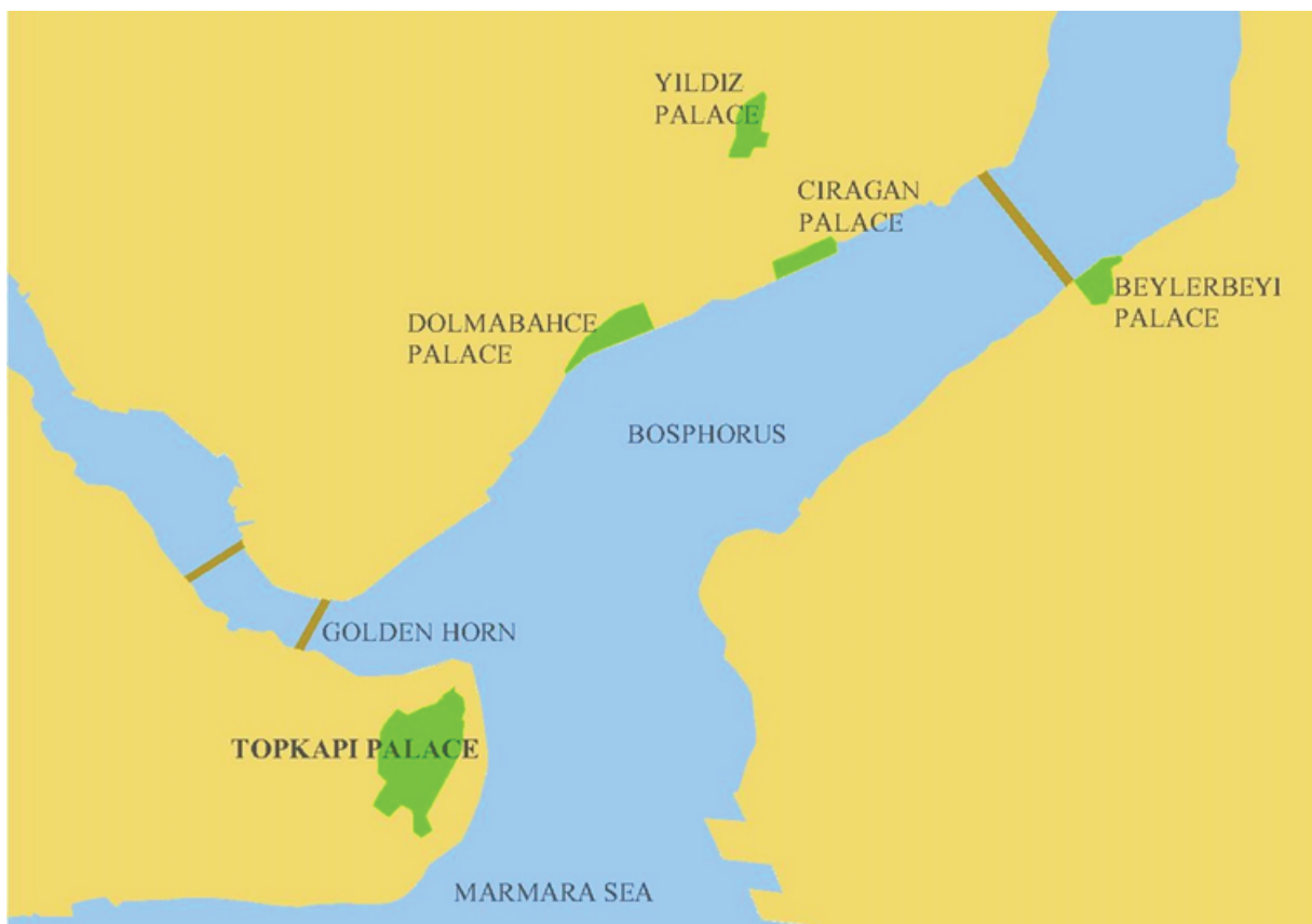
Figure 1 (top) Location of Istanbul (after Google Earth, 2012).