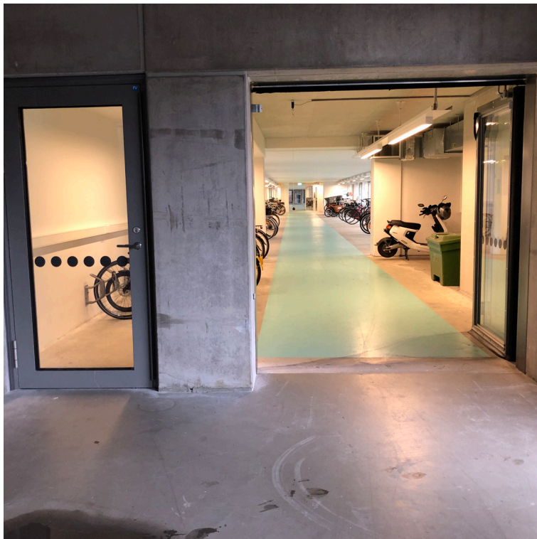
Figure 15 Tenants are expected to be able to use a bicycle or walk. Brf Viva.

The housing project Viva was presented as highly innovative from a green, sustainability perspective. The planning documents also expressed high ambitions in terms of social sustainability. The detailed