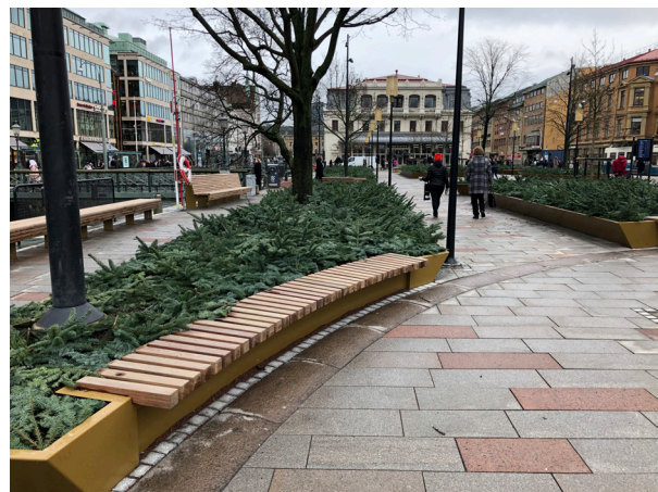
Figure 8 (top)

The difference in colours facilitates awareness of the gradient and understanding of where the slope starts and ends. The slope connects two buildings to each other. The slope offers an equal and accessible solution for all users. Högvakten.