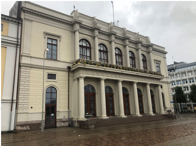
Figure 3 A new entrance for all visitors was created beside the previous main entrance. The solution is equal to all users and does not separate people from each other. Högvakten.