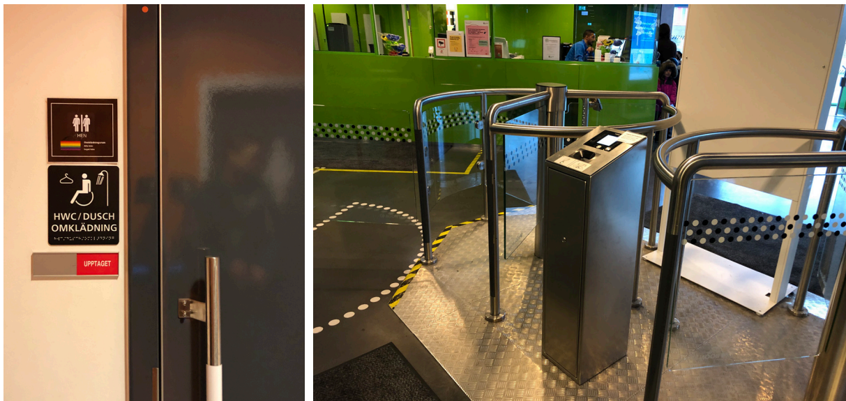
Figure 13 (right) Visitors who cannot use the turnstile (i.e., those in wheelchairs or using walkers, overweight visitors or visitors who do not understand how to perform the operation to unlock the narrow passage) have to request help from reception for access via a wider passage. Angered's Arena.

Other examples of how categorisation of users in the planning stage impact the completed environment are from the housing block Viva . Already in the detailed development plan, accessibility was only projected for reaching the flats, not the common facilities: “The accessibi-