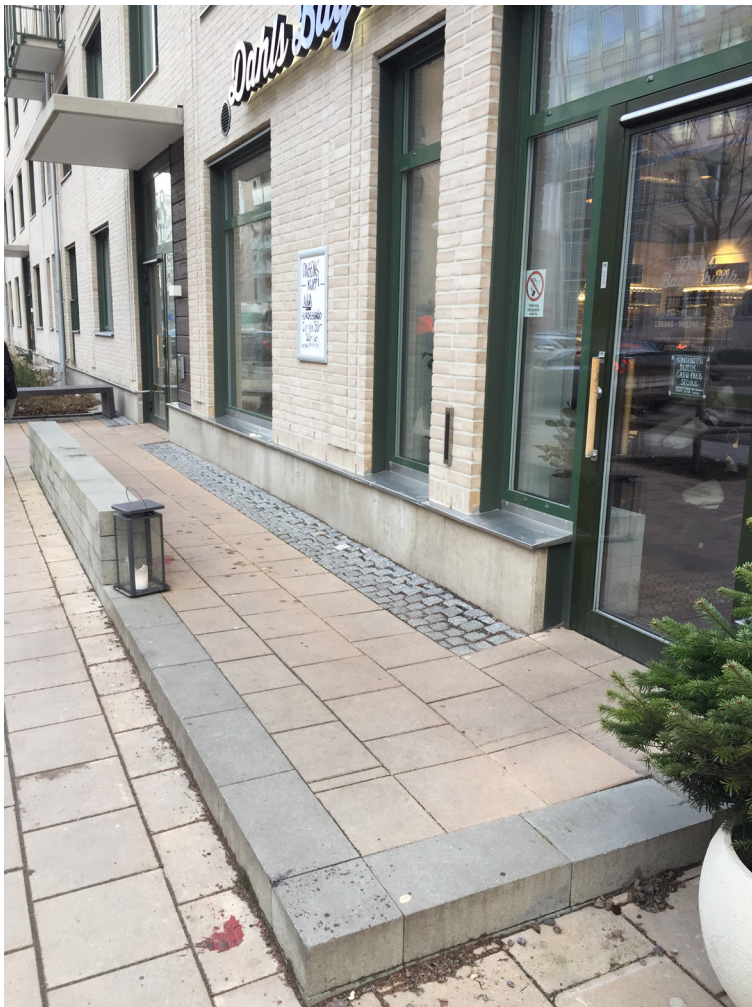
Figure 14 A ramp was required, although the flat terrain would allow construction of entrances without differences in level. Östra Kvillebäcken .

Special solutions for some users were found at Östra Kvillebäcken . There were some differences in level between the entrances to the newly constructed buildings and the pavement, meaning that a ramp was necessary for some users, although the site was on flat terrain. The resulting ramp separated those who use steps from those who do not (Figure 14).