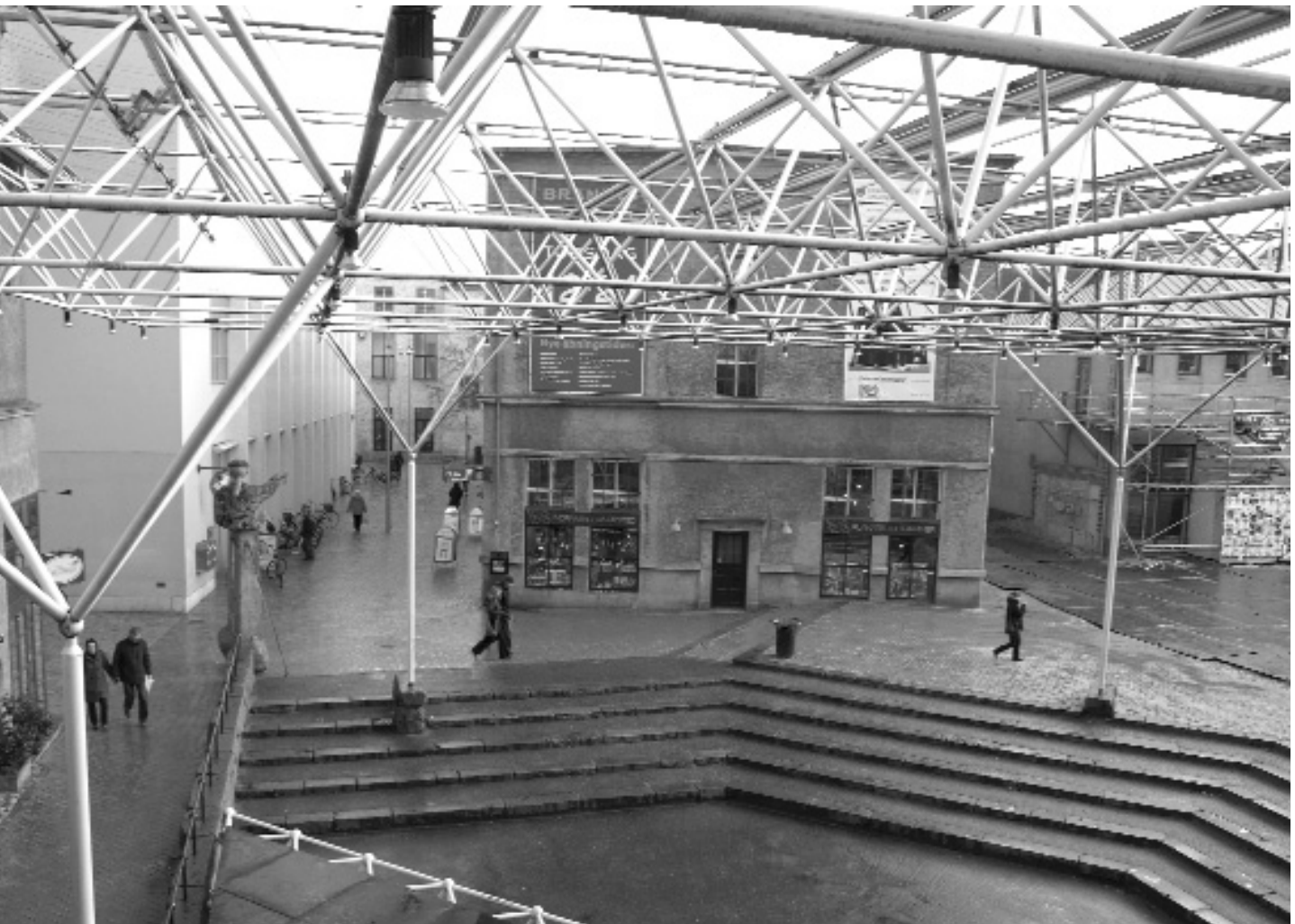
Brandts is one of the oldest hybrid cultural project in Denmark. It is located in an old factory in the core center of Odense. It contains Kunsthalle, a photo museum and a media museum. The three institutions works together and have established a learning lab. that communicate the activities to guests, especially children in a very professional way. Brandts has had a large effect on the cultural development in Odense and on the urban transformation of the city centre.

Without going deeply into it, one of the key urban leisure activities of the contemporary city must be acknowledged to be shopping or even the merging of entertainment and shopping into 'fun-shopping' (Boer & Dijkstra 2003:185).