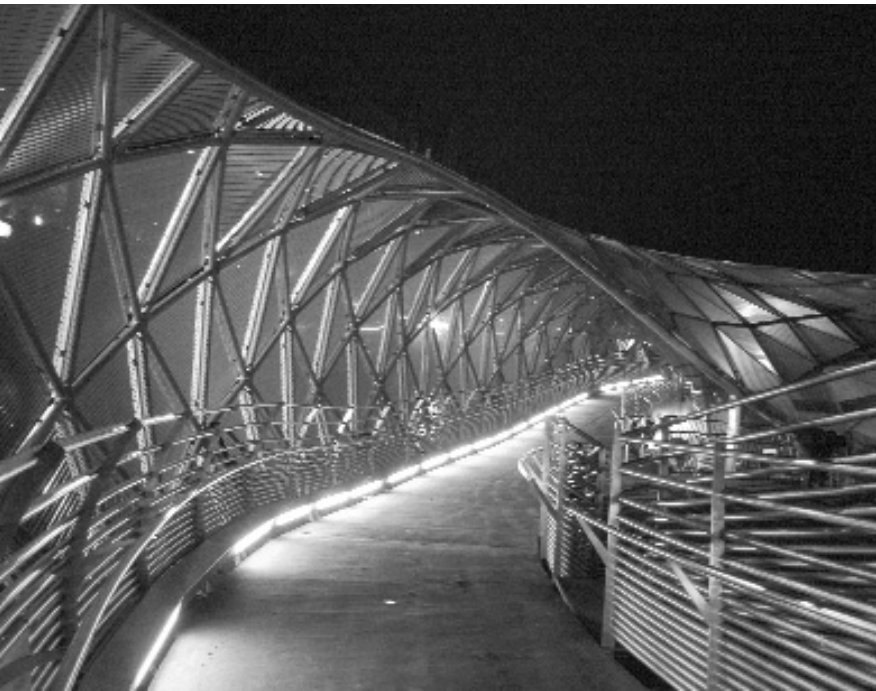
Restaurant and public performative urban space included in pedestrian bridges over the river Mur in Graz.

sed) experience value (Klingmann 2007:44). With reference to Bernd Schmitt's analysis of marketing we may want to re-phrase our