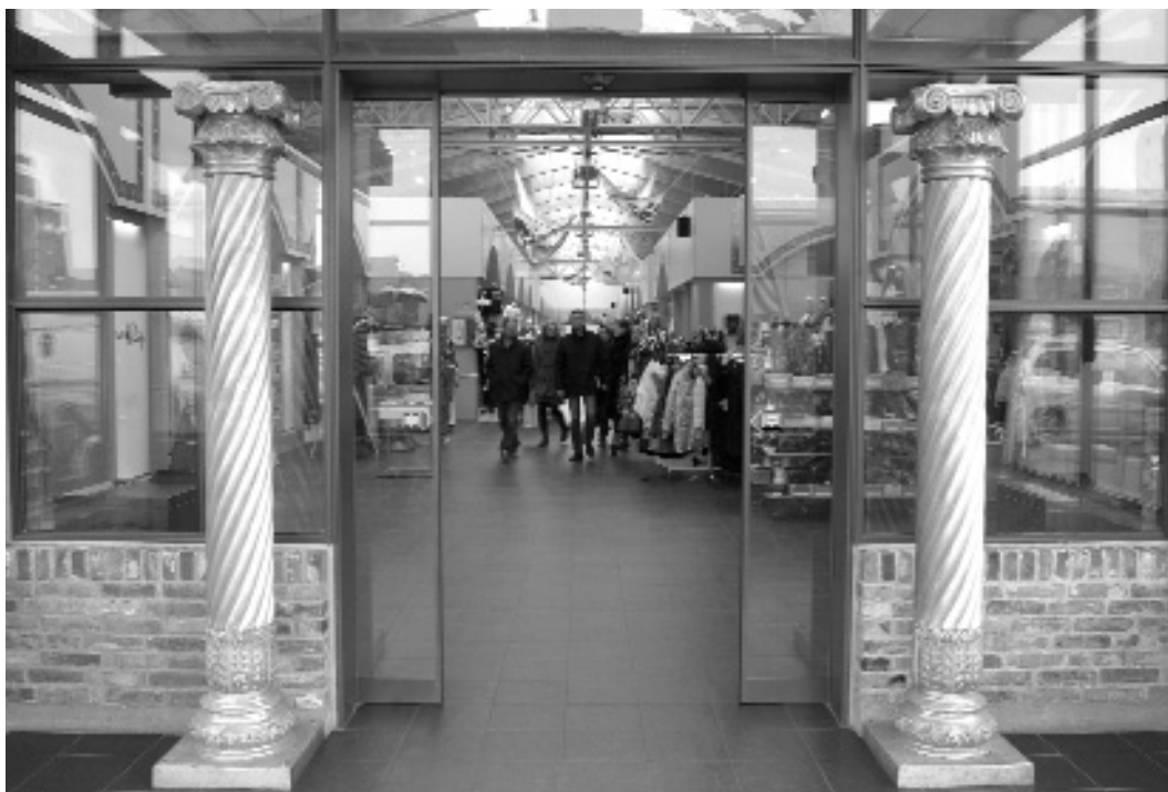
Bazar Fyn: will a new cultural intervention like Bazar Fyn in Odense give a more diverse urban life and create a public domain for exchange of cultures between the old citizens and newcomers?