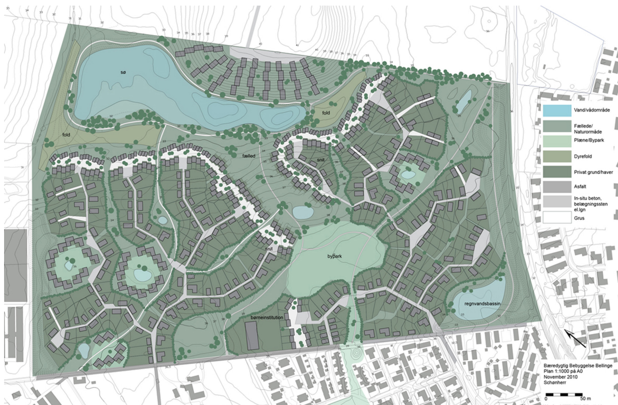
Figure 3 Schønherr a/s (2010). Bellinge Fælled, structure plan.

8 The density of the area will be identical to Bellinge village (= 22) (Odense Kommune and Schønherr a/s, 2010, p.4).