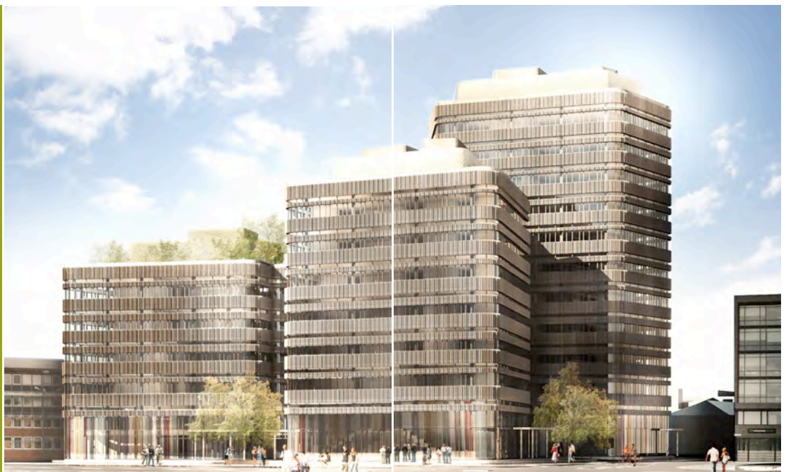
NIAGARA Lundgaard & Tranberg Arkitekter