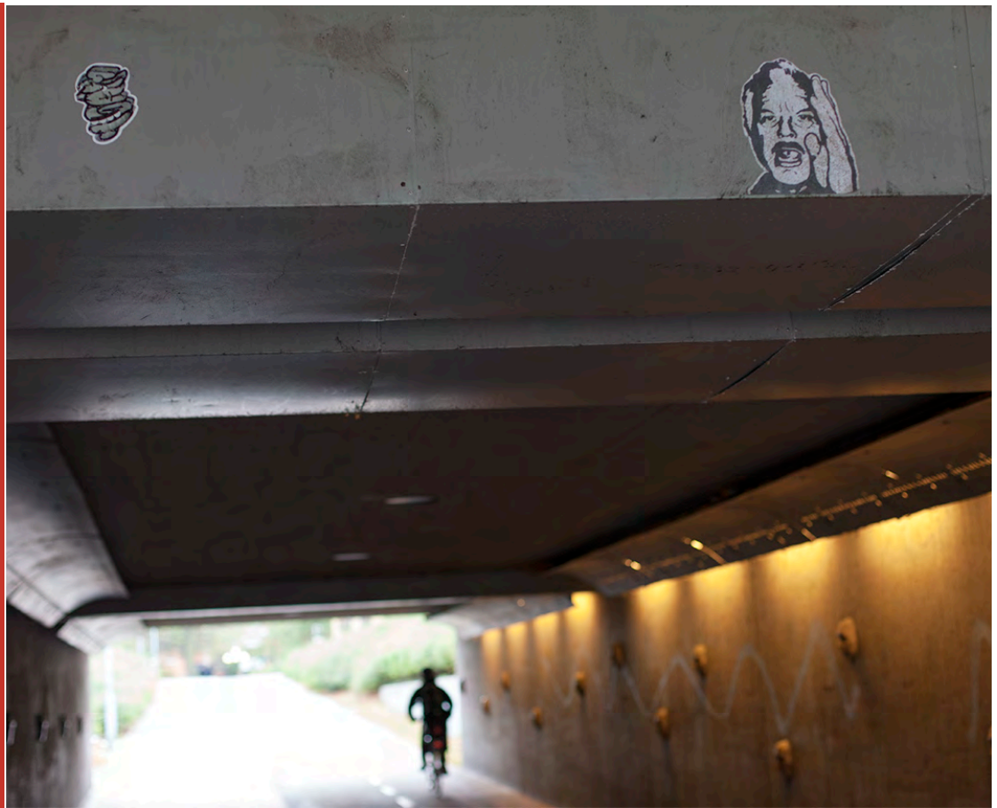
LONG THE PATH