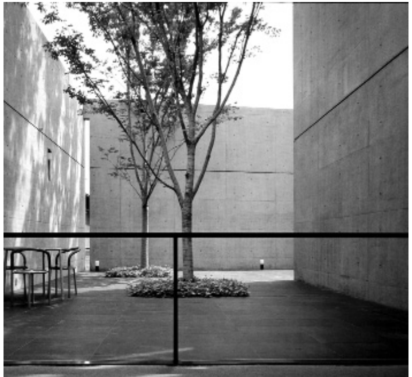
Picture 12 Kidosaki House, Tokio, 1982-86, Tadao Ando. View from inside out.

"Design places, not buildings." 33 This advice Reima Pietilä gave to architecture students at the University of Oulu in the 1970s was intended as an exhortation to shift the accent from an image-centered division of building surfaces to a spatial and perceptual experience of the environment. Similar ideas have been expressed by one of the most important reformers of architecture in the 1990s, the Spaniard Enric Miralles: " The new extension (Rosenmuseum in Steinfurh) would not be a building, but the place where the growth of the flowers would be exhibited outside. " 34