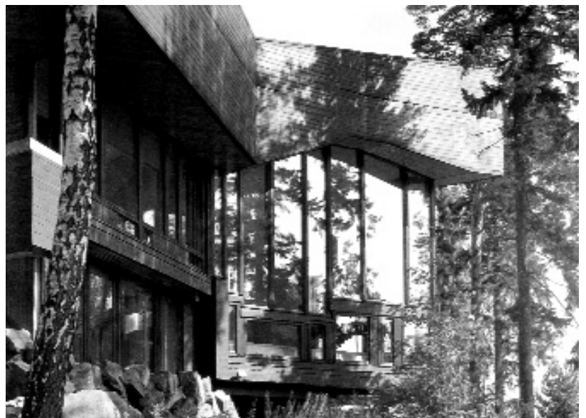
Picture 7 Dipoli, Reima Pietilä, 1966. In Reima Pietilä’s Dipoli Center, window alignment is used to transpose spatial relationships from the forest to the building facade, 1966.

Pietilä’s design method involves carrying out a series of practical steps. Firstly, the seeing stage involves acquiring a concrete understanding of the site and includes several methods of inspecting it, including maps, cross-section drawings, photographs and drawings and, in Pietilä’s case, also the activation of the mind