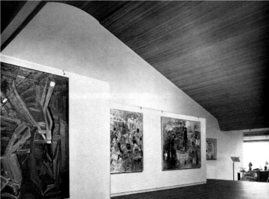
Picture 15 Maison Carré, 1956-1959, France, Alvar Aalto. Maison Carré's curving ceiling and top lighting, together with the easily flowing and widening spatial rhythm, create an atmos- phere of a natural place.