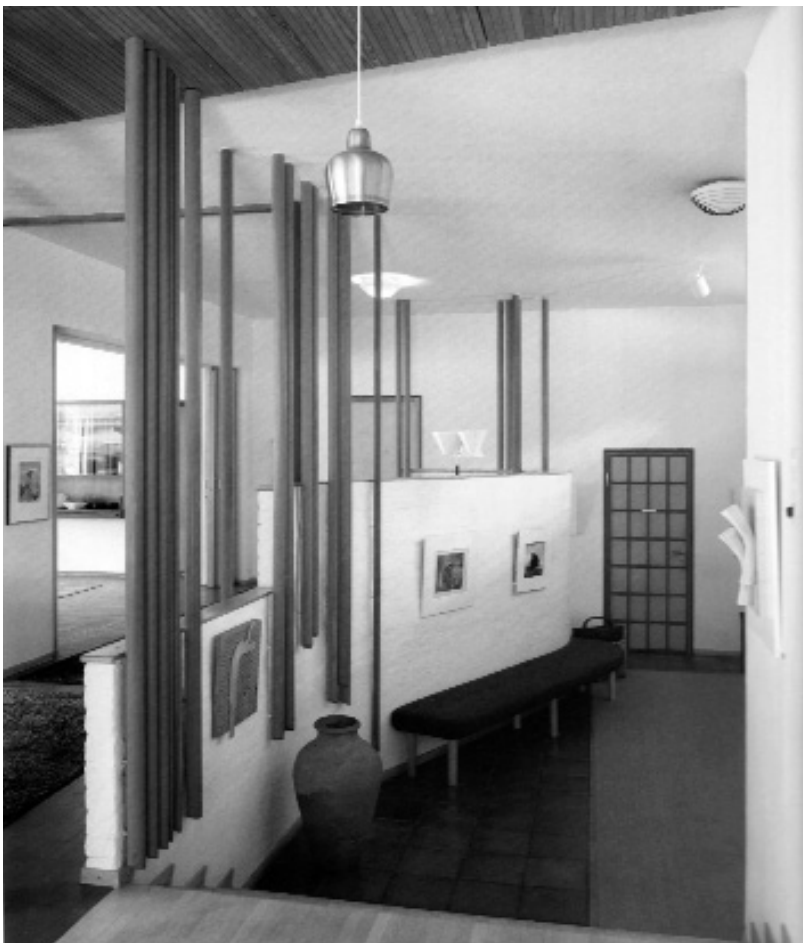
Picture 6 Villa Mairea, Alvar Aalto Confinement adjustments and elevation changes can be used by architects to create a "forest-like" space.

Humans conceive of nature in two ways. Firstly, sense and perception have laid the foundation for the idea that humans and nature are interconnected through sensory analogy : the structures of nature and the perceiver are similar or at least have a common evolutionary foundation. To be able to receive sensory information about the natural environment, our sense organs must be part of nature; they are produced by the laws of nature and have developed for the versatile perception of our environment. Hence, nature is extended to include humans, who are an integral part of it in terms of evolution and growth, and thereby capable of living in nature. Humans have an inherent relationship to natural environments they inhabit, and those environments have governed their sensory evolution. 16 Organic architecture represents a romantic approach, which appeals to our senses and emotions. 17