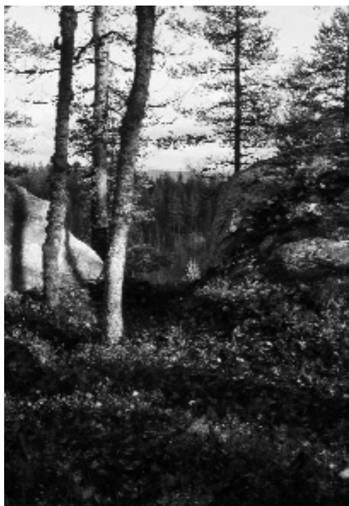
Picture 4 Koli Hills, 2003. Room in a forest, with a view onto an open landscape, extending to the horizon over the tree tops in the valley. The ground cover is invitingly soft, while the rocks and tree trunks offer hikers a cosy, contained resting place and support their backs during a coffee break.

The sun was up so high when I waked that I judged it was after eight o'clock. I laid there in the grass and the cool shade, thinking about things and feeling rested and ruther comfortable and satisfied. I could see the sun out at one or two holes, but mostly it was big trees all about, and gloomy in there amongst them. There was freckled places on the ground where the light sifted down through the leaves, and the freckled places swapped about a little, showing there was a breeze up there. A couple of squirrels set on a limb and jabbered at me very friendly. 4