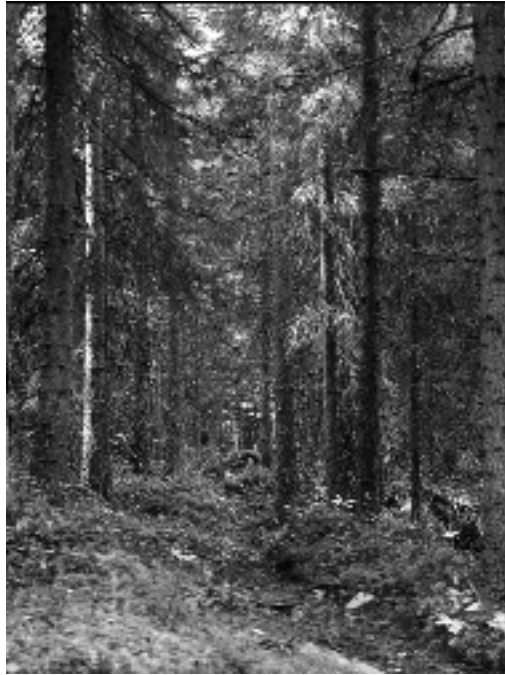
Picture 3 Koli Hills, 2003. Cosy twilight in an old forest. With time, the spatial structure of the forest has acquired an open and spacious appearance with the great trees occupying their own growth space under a closed canopy.

landscapes as analogous spatial phenomena. Becoming cognizant of these analogies may serve as a source of inspiration for practicing architects in their everyday work.