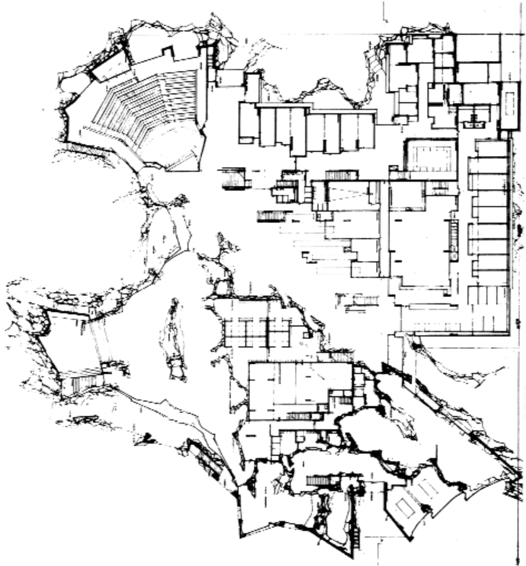
Picture 8 Dipoli Center, Otaniemi, 1966, Reima Pietilä. Ground plan. Rocky forest landscape from a bird's eye view; Reima Pietilä's graphical illustration mirroring the natural environment of the Dipoli Center.