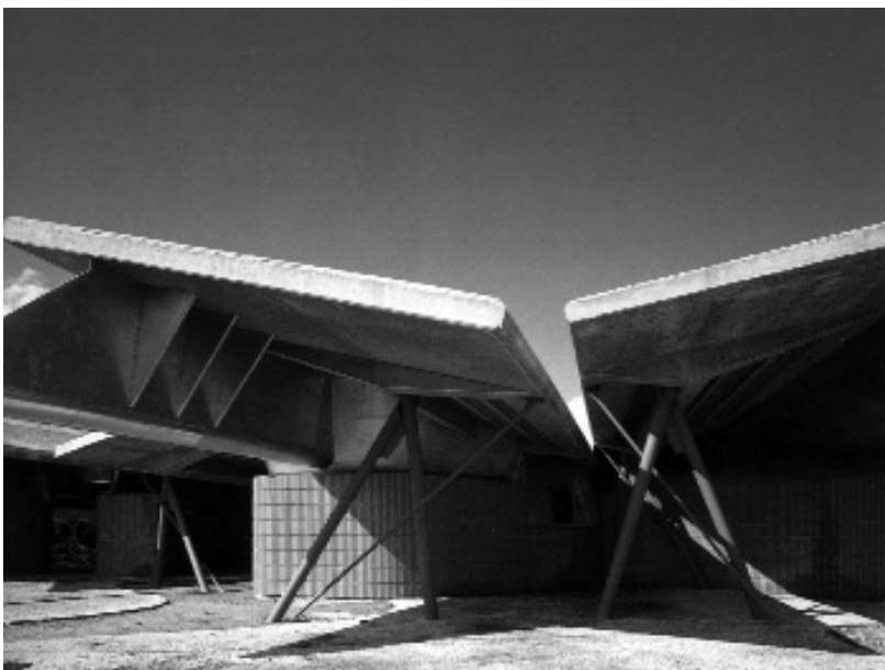
Picture 10 Barcelona Archery Range, 1991, Miralles & Pinós.

In describing the Suvikumpu housing estate, Pietilä remarks that “the disposition of the mass of buildings is isomorphic with the topographical forms of the site. The mass is broken down like the irregularly eroded rock, responding in the isomorphoses of the horizontal and vertical directions to the form of the rock itself”. 26 Pietilä’s landscape or site-inspired form language stands out from the mainstream of Finnish modernism: his construction form emerges from natural form through abstraction, simplification and “straightening”. Aalto’s characteristic free-flowing curve symbolizes the presence of nature’s irregularity. To Pietilä, geometry is artificial, while topology is natural, representing the gradual transformation and variation of form which generates form relationships or form families. Constructing an entity, these form families are fragments of forms constituting a coherent series of variations and a connection to the structure of the surrounding landscape. Pietilä himself explains the background for his architecture as follows: