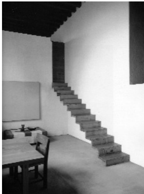
Picture 13 Luis Barragán House, Mexico City, 1947, Luis Barragán.