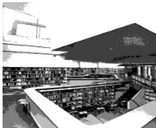
Picture 5 Rovaniemi Library, 1968, Alvar Aalto. In Aalto's Rovaniemi Library, lighting from above in conjunction with reading hollows creates fundamental spatial relations, which are familiar to us from the natural environment. Lit obliquely from above, the niches seem to offer shelter and comfort which is comparable to that of forest rooms, whose sense of space inescapably invites us to spend time in them. In every library he has designed, Aalto uses the decorative quality of bookshelves and backs of books as spatial elements; the shelves form arbitrary raanu-like hangings on the walls, which serve to provide a white background - an essential element in this context. At the same time, the shelves comprise a geometric element that complements the otherwise mainly topologically structured space.