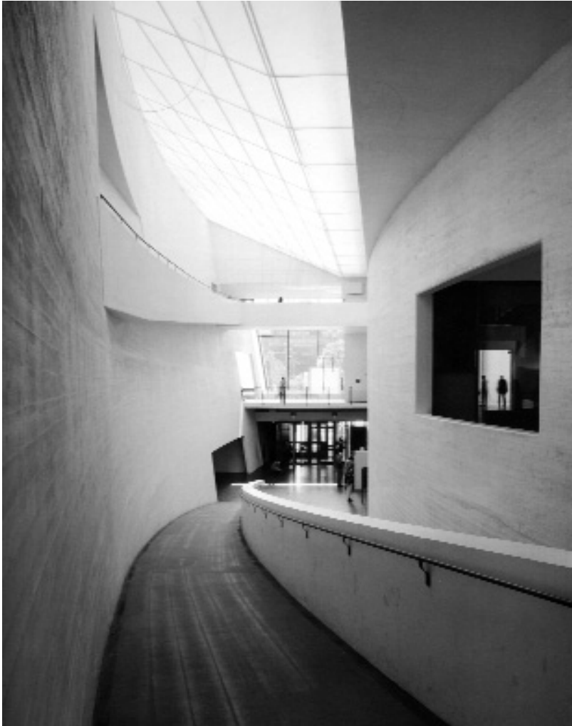
Picture 14 Kiasma, Helsinki, 1998, Steven Holl.

As a design object, "place" is different from building. When we design a building, the emphasis tends to fall on surface projections, ground plans, facades and their internal and mutual relationships. The focus is thus on the two-dimensional structuring of surfaces. Key points of interest are what the building looks like and what impression the surfaces create. Place as a design object involves having a conscious relationship with the environment and an awareness of depth. When the design focus is on place, we are actually designing the relationship between a building and its environment. We thus zoom in on the depth impression of the site rather than the building surfaces. A cross-section or perspective drawing can be used to relate the structure of the building to that of the site or, conversely, elucidate how the spatial structure of the site is reflected on that of the building. Manipulation of the structure of the site gives rise to the building's relationship with the surrounding landscape, the characteristic integration of natural landscape in architecture.