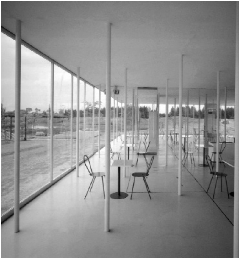
Picture 11 Park Café, 1998, Kazuyo Sejima.

However, the forest may also take other expressions. In the Embassy building in New Delhi, Pietilä further elaborates some of the themes present in the Dipoli Center and adapts them to another culture and climate without losing the characteristic Finnish attitude. A central element in the building's exterior is the motif created by the beautifully billowing roof, analogous to a forest edge which, akin to a canopy, provides shelter from excessive light and heat. Here, Pietilä avails himself of a design method where elements arranged at different levels to mimic the spatial structure of the natural world are interdependent, yet follow their own transformation logic, which makes them somewhat detached from each other. Processes at the floor or terrace levels and at the wall and ceiling level are all autonomic transformation objects which, just like the terrain, tree trunks and canopy of a forest patch, constitute a whole allowing, for example, a single tree growing in a particularly favourable spot to extend its branches further than those of its neighbours. A similar method 29 was used by Enric Miralles in the design of the Archery Range in Barcelona, the ground plan of which, despite its dissimilar form, reveals a close relationship with Pietilä's work. In the same vein, the view toward the roof is spatially analogous with the Embassy building.