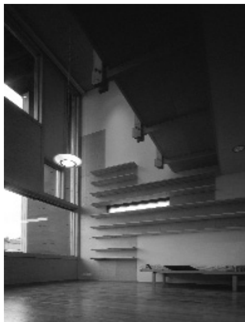
Picture 2 House Foni, Oulu, 2005, Lauri Louekari.