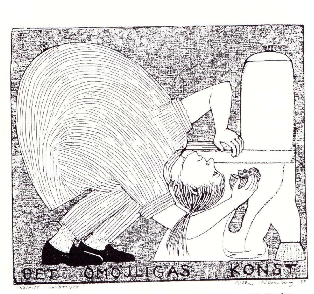
"Det omöjligas konst". Träsnitt av Ulla Wennberg.