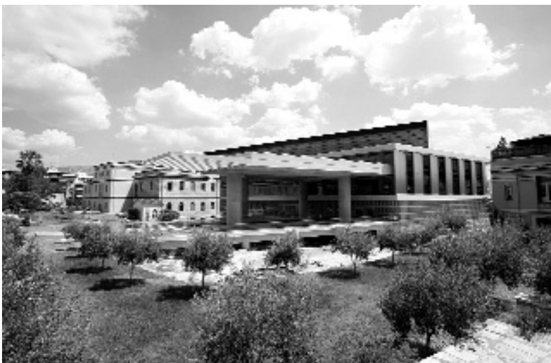
The new Acropolis Museum, B. Tschumi, M. Fotiadis

In 2007 the New Acropolis Museum finally became a reality. Since 2008 the Museum is in operation, but the arguments, the protests, the debates etc. still go on concerning a wide variety of issues. But then, isn't it true that this is what the international experience from the practice of Architectural Competitions shows we have to expect, further to the legal, regulatory etc. issues?