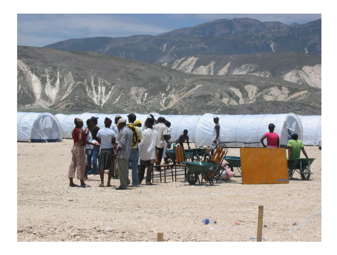
Figure 6 Out-of-Place and permanent temporality. Corail-Cesselesse, Haiti (2010).

asylum and protection at one point became identified with spatial confinement (ibid., 2017, p. 32). During the interwar period between World War I and World War II, in those situations when refugees were recognised as co-nationals, the accommodation of refugees was a housing issue; after World War II, when refugees became a humanitarian problem, permanent housing would be replaced by seemingly temporary camps (Herscher et al., 2017, p. 70–71). The inclusion of refugees in an immigrant neighbourhood, a secure and productive site of settlement, resulted from critiques by refugee organisations, NGOs, architects and planners that camps were an unsustainable and inhumane form of refugee settlement. Herscher's theories reveal that the room for providing meaningful contributions for architects in displacement situations is limited by the establishment and mandate of the intergovernmental organisations in question.