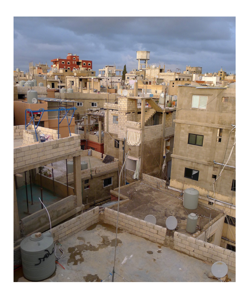
Figure 7 The loss and recreation of place. Bourj Al Shamali, Lebanon (2015).