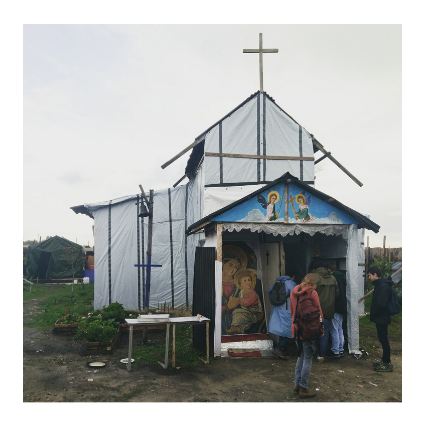
Figure 5 Flexible place attachments. Calais, France (2016).