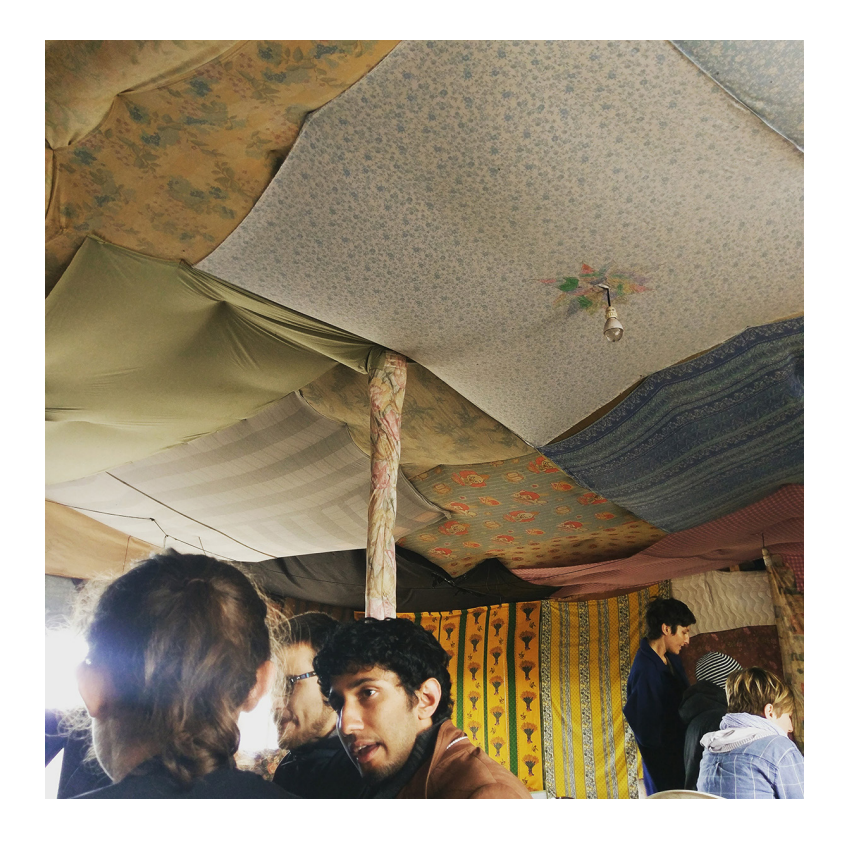
Figure 4 Auto-construction as place recreation. Calais, France (2016).

Space and place constitute critical dimensions of wellbeing that deserve much greater attention because constructions of wellbeing are intrinsically connected to the places in which they are generated. The auto-construction, architecture and design of urban spaces by displaced communities entail important socio-cultural processes that give shape to and expresses feelings of belonging, identity and placemaking. (te Lintelo et al., 2018, p. 67)